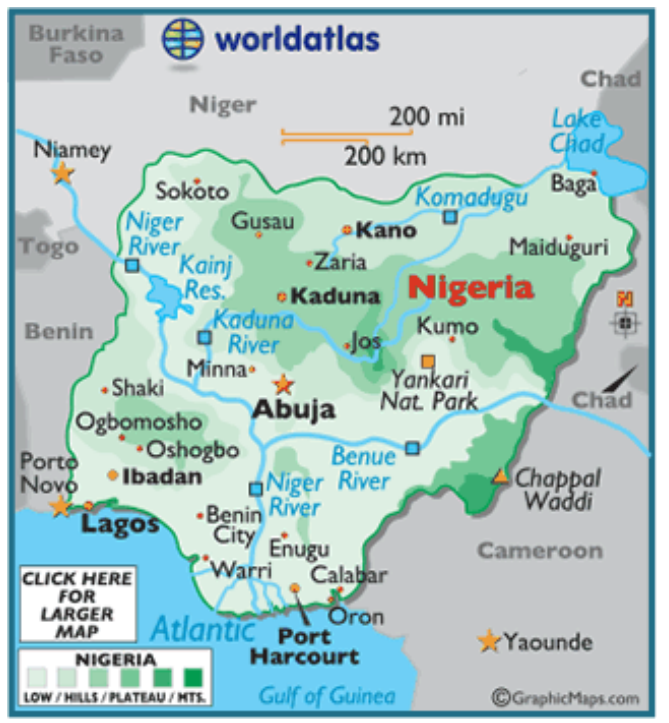
Figure 2: Map of Nigeria showing Abuja, Federal Capital Territory.